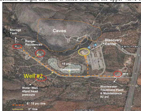
Figure 1: Layout of Kartchner Caverns State Park

The sole source of water for the park is groundwater. There are multiple wells located within the park, but Well #2 is the only one that currently serves the park. The well is located at the southwest side of the park below the main campground area (Fig. 1). The average annual pumping for 2007 was measured at 2.3 million gallons (MG). The average daily withdrawal is 6,000 gallons per day (gpd) but can be as high as 20,000 gpd during the peak season and as low as 4,000 gpd. The water is pumped to the surface utilizing a 3-hp 480 V 3-phase submersible pump. The water distribution system (Fig. 2) is manually operated and requires that the pump be turned on every morning in order to fill the 3000 gallon storage tank (elev. 4732) located northwest of the well. The elevation difference between the well and the tank is 75 ft over a horizontal distance of 1800 ft (4% grade). Once the tank is full, the pump is turned off and the park utilizes the elevation head to drive the flow. If demand is high, the tank is filled first and the upper valve is closed. The park then serviced directly from the well. Metering for the potable